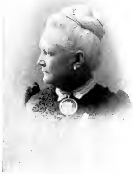
MARY CUNNINGHAM LOGAN.

and grace made her famous. General Logan owed much of his success in life to this devoted, tactful and talented woman, who steadily grew in honor in the estimation of the public, as did her husband. It was a terrible blow when the strong man, of whom she was so proud, was struck down with disease, and the mortal put on the immortal. To a woman of Mrs. Logan's ambitions, to say nothing of her strong affection for her husband and her activity, that stroke was appalling, and she nearly sank under it, but for the sake of the son and daughter left she rallied, and recovered her health and power to live, through change of scene and a trip to Europe, chaperoning the Misses Pullman. On her return Mrs. Logan received the offer of the position of editor of the "Home Magazine," published in Washington, which position she has continued to fill acceptably ever since. The family residence, "Calumet Place," Washington, in which Gen. Logan died, was then a new and